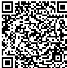
QR Code for online giving

Our church now can accept online giving! Check out the "Give Now" button in the top right corner on our website.