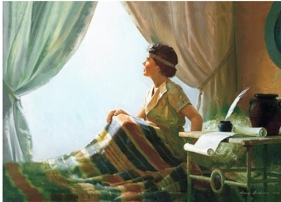
The Lord Calls Samuel

Worship on the Lord's Day January 14, 2018, 10:30 am