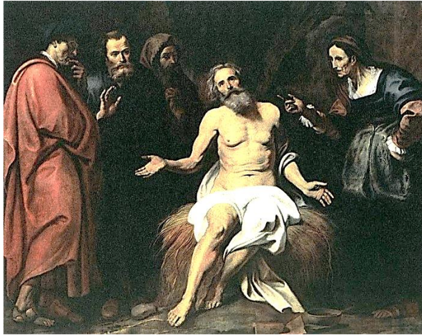
Job with His Friends by Gerard Seghers (17th c.)

Worship on the Lord's Day June 24, 2018, 10:30 am