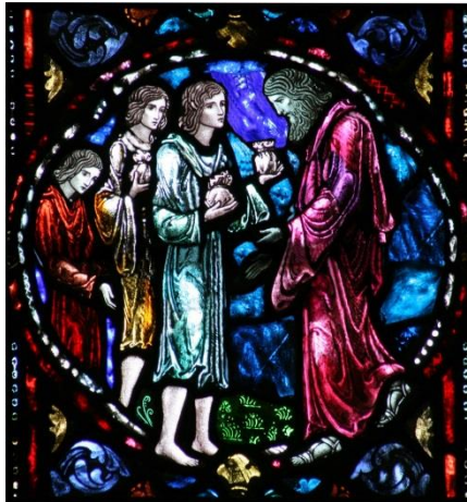
The Parable of the Talents

Worship on the Lord's Day November 19, 2017, 10:30 am